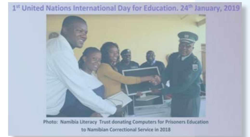
1 st United Nations International Day for Education, 24 th January, 2019

EPEA also congratulates them with the 1st United Nations International Day for Education on 24 January 2019, which they organised in collaboration with Unesco and the African prison administrations.